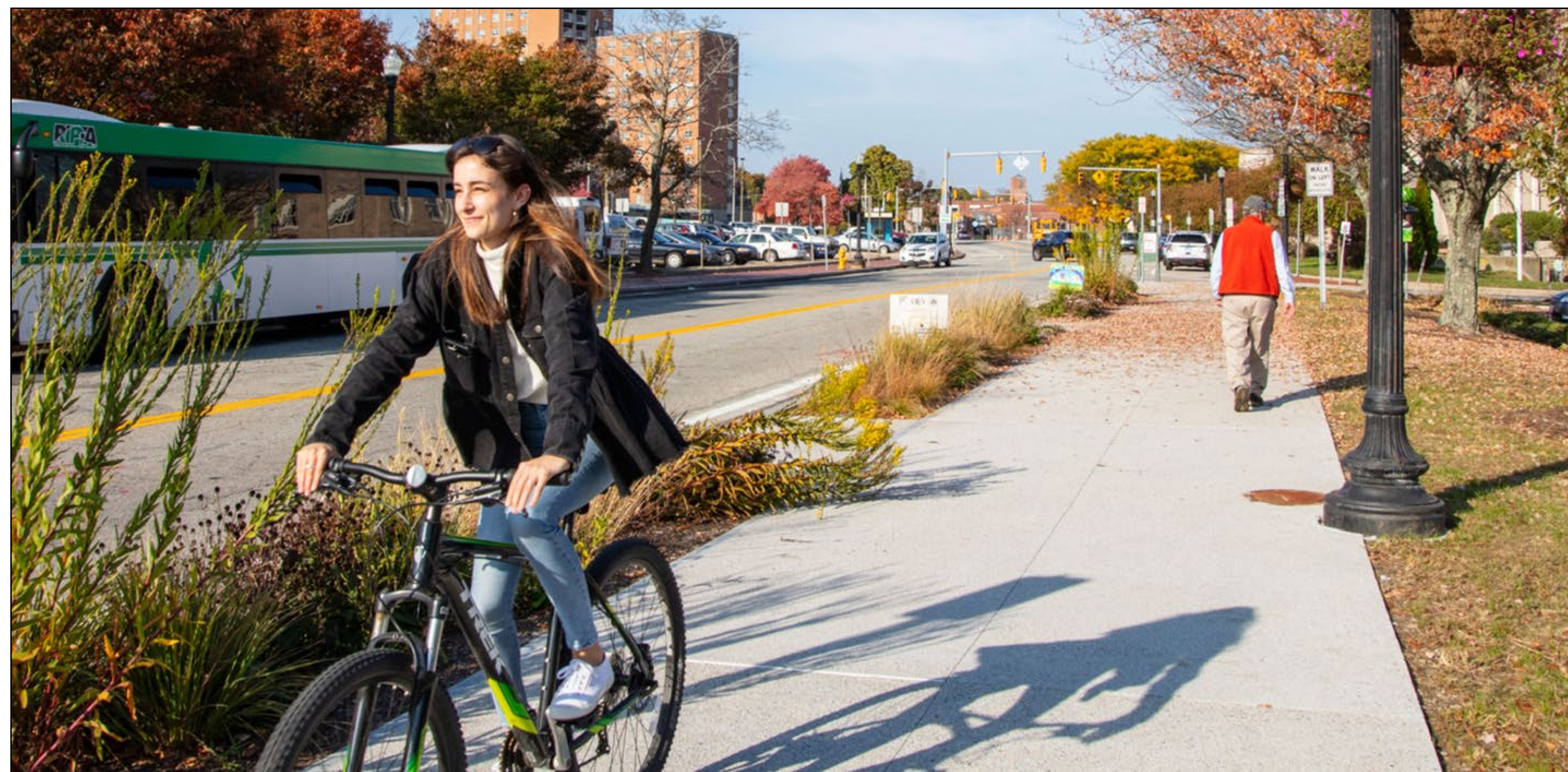
Separated Shared Use Paths and Sidewalks