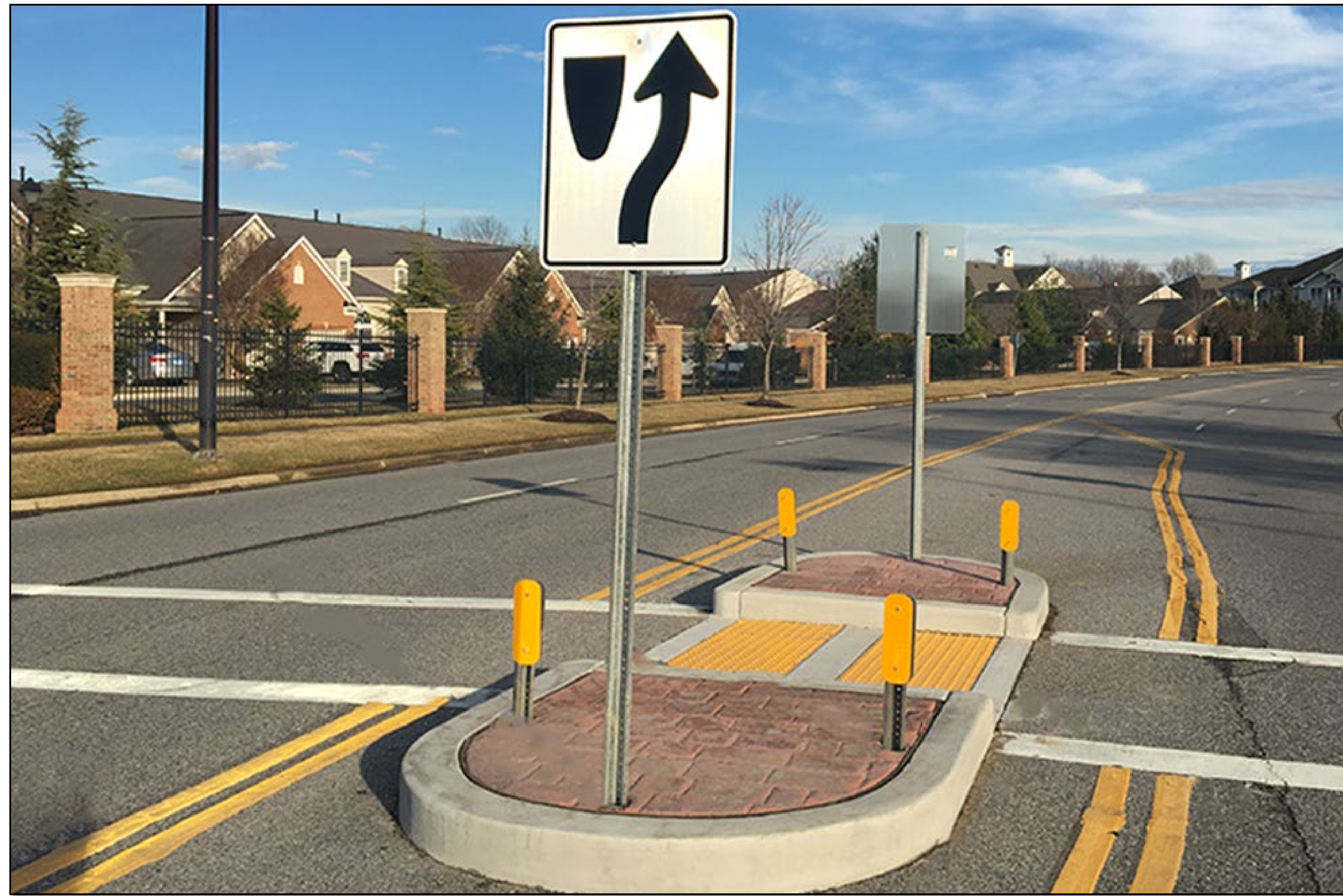
Islands at Crossings